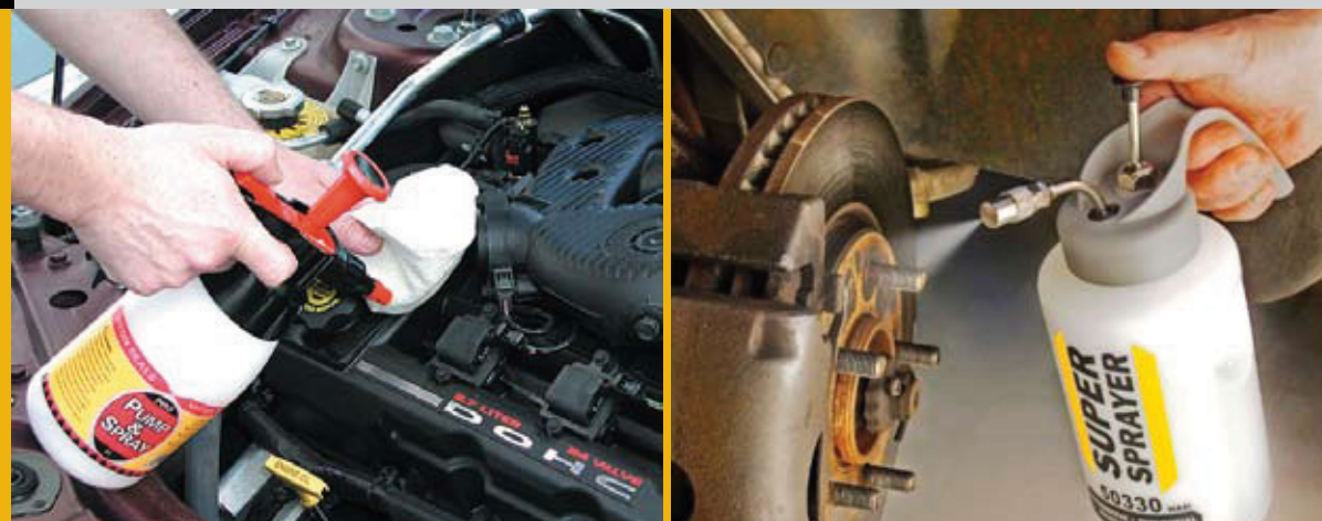
Brake Cleaners • Engine Degreasers • Detail Products • Solvents

Toll Free Tel.: 1-888-984-9441 Toll Free Fax: 1-888-984-9840 www.fbs-online.com sales@fbs-online.com